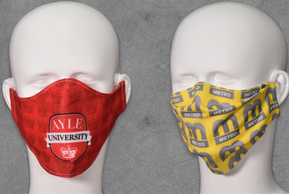
🛒 Regular Branded Face Masks 25 from £139