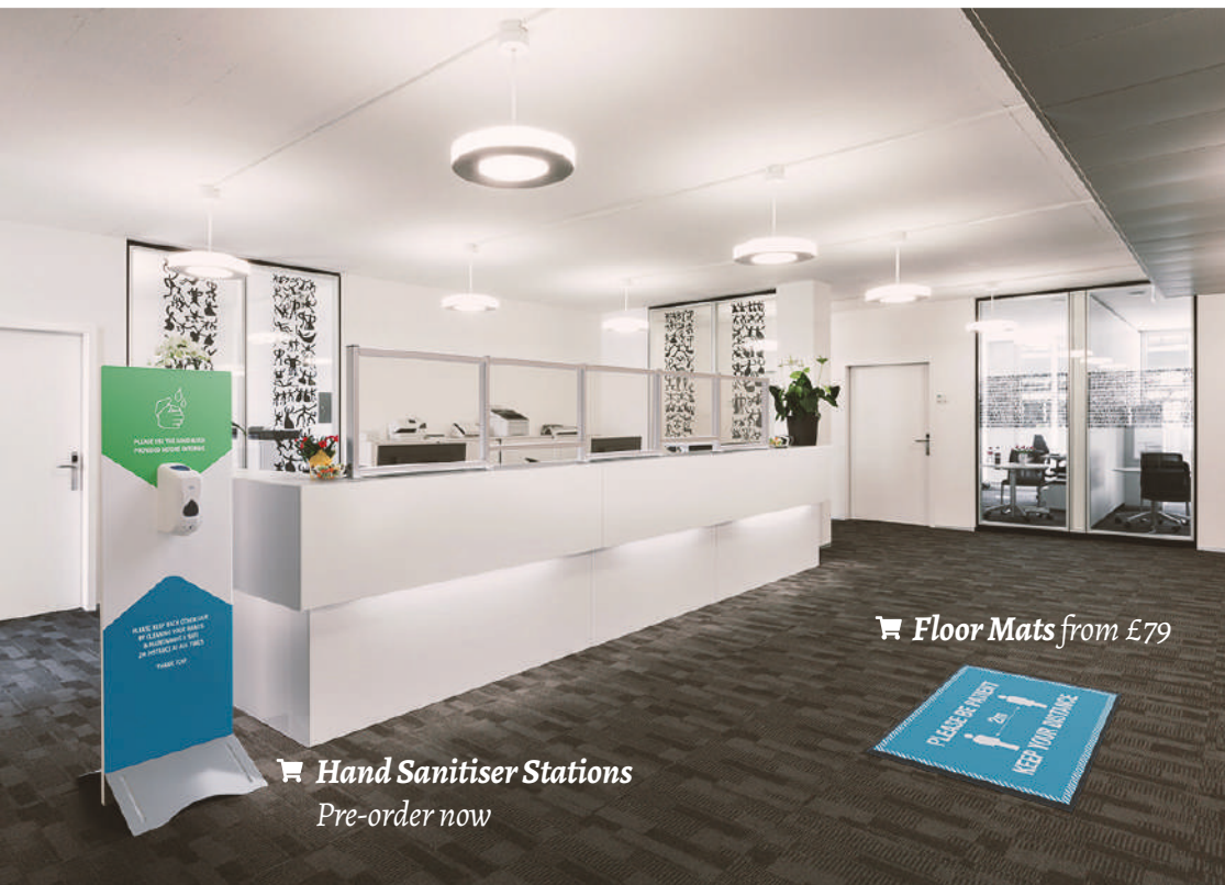
🛒 Floor Mats from £79