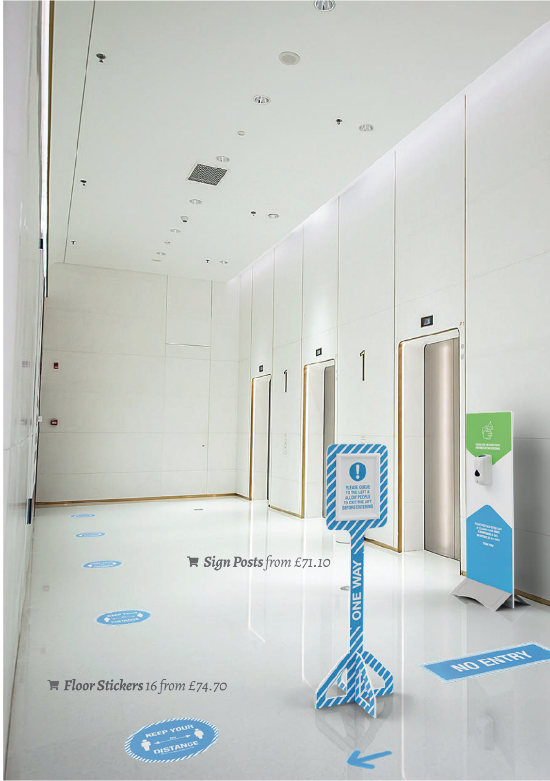
🛒 Sign Posts from £71.10